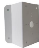
DS-1276ZJ Corner Mounting Bracket